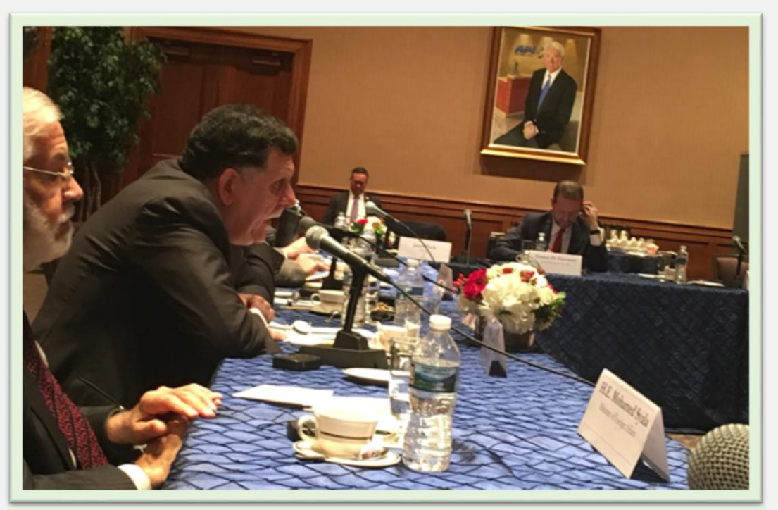
H.E. Faiez Serraj, Prime Minister of Libya, addresses the audience at a USAfBC roundtable discussion.

We will continue to work closely with the Embassy in D.C. to develop these relationships to strengthen the bilateral trade partnership between the U.S. and Libya.