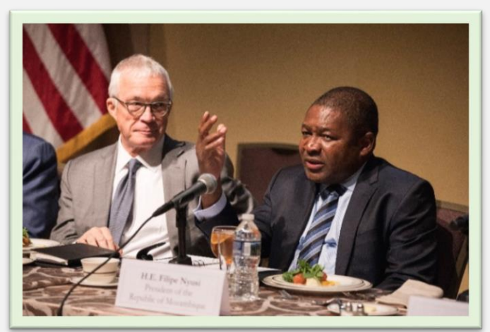
H.E. Filipe Nyusi, President of Mozambique (right), addresses USAfBC members during a roundtable discussion at the Chamber.

13 Bilateral Discussion with H.E. Raymond Tschinbanda, Special Envoy from the President of the Democratic Republic of Congo