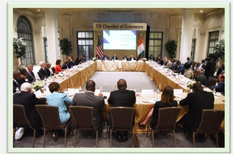
H.E. Amadou Gon Coulibaly, Prime Minister of Côte d'Ivoire, addresses the audience during a roundtable discussion at the Chamber.