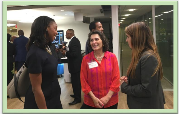
Attendees engage in a networking session following the High-Level Panel on Infrastructure Development in Africa.

trade agreement as well as to mount pressure to implement the Trade Facilitation Agreement, ratified in February. Activities pursued as part of the Retail Supply Chain Task Force include developing a road map and planning for a workshop in Nairobi in 2018. Recent leadership changes within AmCham Kenya, Ethiopia, and Uganda present a strategic opportunity to strengthen linkages and deliver superior value