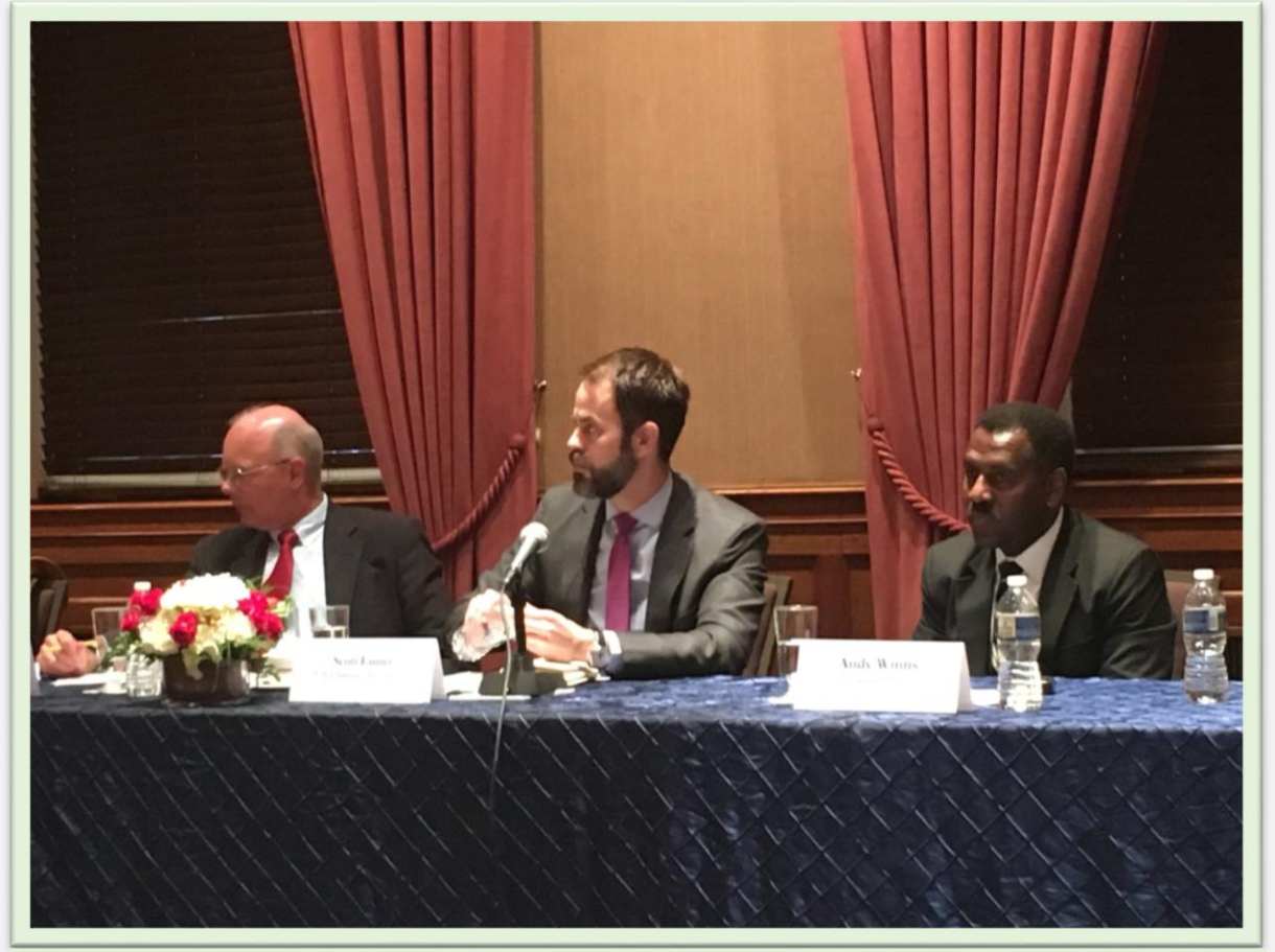
Scott Eisner, USAfBC President (middle), delivers introductory remarks at the roundtable discussion featuring H.E. Faeiz Serraj, Prime Minister of Libya.