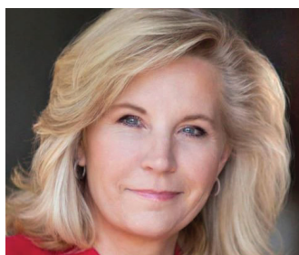
CONGRESSMAN LIZ CHENEY CHEYENNE OFFICE 2120 Capitol Ave Suite 8005 Cheyenne, WY 82001 Phone: (307) 772-2595