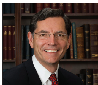
SENATOR JOHN BARRASSO CHEYENNE OFFICE 2120 Capitol Avenue Suite 2013 Cheyenne, WY 82001 Phone: (307) 772-2451