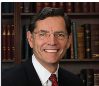
SENATOR JOHN BARRASSO CHEYENNE OFFICE 2120 Capitol Avenue Suite 2013 Cheyenne, WY 82001 Phone: (307) 772-2451