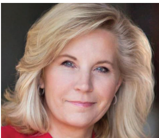
CONGRESSMAN LIZ CHENEY CHEYENNE OFFICE 2120 Capitol Ave Suite 8005 Cheyenne, WY 82001 Phone: (307) 772-2595