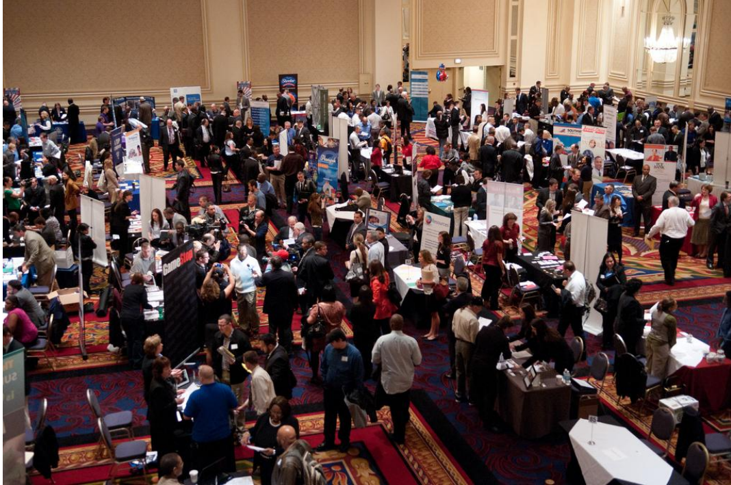
Military Spouse Hiring Fair in Washington, DC – January 13, 2012