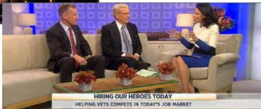
Below: General McChrystal, Tom Brokaw, and Ann Curry on “The Today Show”