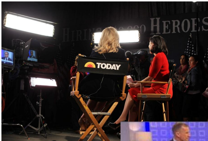
Left: “The Today Show” broadcasting during the Hiring Our Heroes job fair aboard the USS Intrepid in New York City

Hiring Our Heroes has partnered with NBCUniversal to raise awareness and keep veterans employment issues visible in the public’s eye. In addition to covering hiring fairs through its local affiliates, on the week of March 25, NBCUniversal partnered with the Chamber across all of its platforms to promote Hiring Our Heroes. In addition to “The Today Show,” this included “Nightly News with Brian Williams,” MSNBC, CNBC, Telemundo, and more.