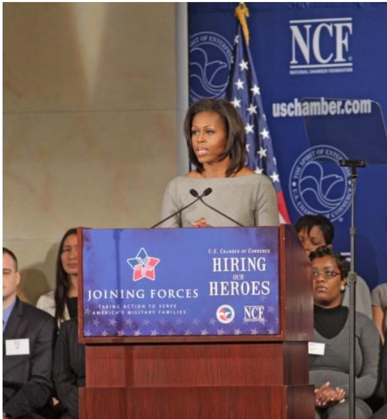
Left: First Lady Michelle Obama at the Chamber's annual Business Steps Up: Hiring Our Heroes event at the Chamber