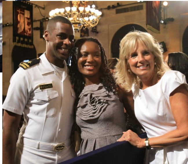
Right: Second Lady Dr. Jill Biden at the Military Spouse Employment Partnership Launch