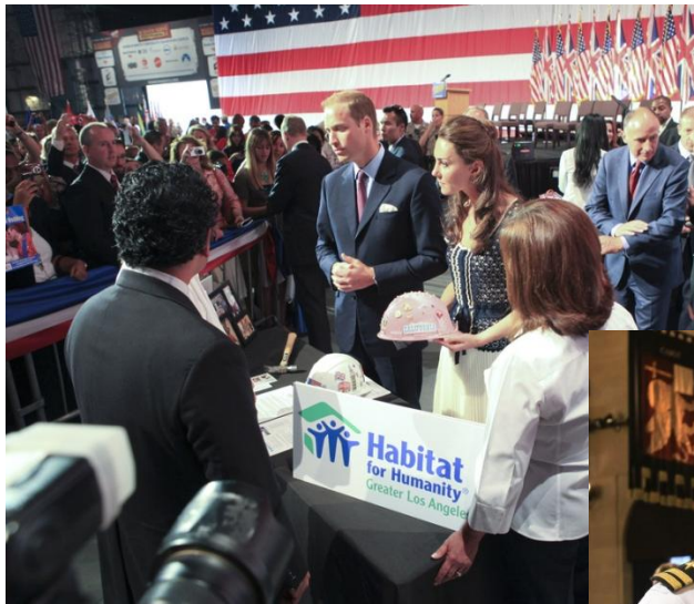
Left: Their Royal Highnesses The Duke and Duchess of Cambridge at the Hiring Our Heroes hiring fair in Los Angeles, CA

Hiring Our Heroes has received nationwide media attention and attracted national and international dignitaries. For example, First Lady Michelle Obama joined us for our annual Business Steps Up: Hiring Our Heroes event in Washington, DC, and for a hiring fair in Hawaii at Pearl Harbor. Their Royal Highnesses The Duke and Duchess of Cambridge joined us for a hiring fair in Los Angeles, CA, during their visit to the United States. Second Lady of the United States Dr. Jill Biden joined us for our launch event for military spouse employment in Washington, DC, and for a hiring fair in New York, NY. See page 13 for a partial list of notable guests at our Hiring Our Heroes events.