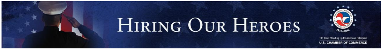
Hiring Our Heroes hiring fair in Chicago, IL – March 28, 2012