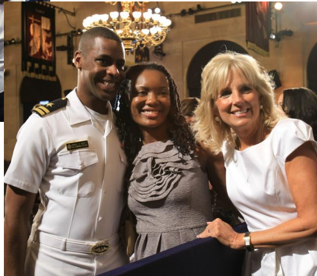
Right: Second Lady Dr. Jill Biden at the Military Spouse Employment Partnership Launch